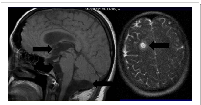
Figure 1: Sagittal view T1 (a) and T2 (b) images from a patient with neurocysticercosis involving the (a.) 3rd ventricle, basilar cisterns, and (b.) parenchyma.

steady-state acquisition (FIESTA), three-dimensional constructive interference in steady state (3D CISS; a modified FIESTA sequence), T2 star-weighted angiography (SWAN), and spoiled gradient recalled echo sequence (SPGR). Thus far, FIESTA and SPGR have demonstrated the best sensitivity in detecting IVNCC<sup>19</sup>. FIESTA is more sensitive than SPGR in demonstrating the cysticercus membrane in subarachnoid NCC, while FLAIR is more sensitive than T2 (but not T1) SPGR<sup>20</sup>. Similarly, SWAN has demonstrated improved detection of IVNCC as compared to traditional MRI<sup>21</sup>. Further, 3D CISS has been used to diagnose previously missed obstructive membranes in IVNCC<sup>22</sup>.